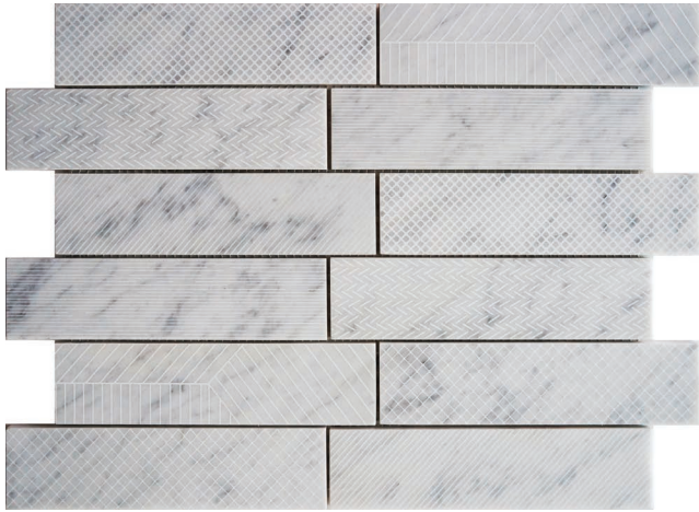
GLADMCA28 | 2x8 stack |