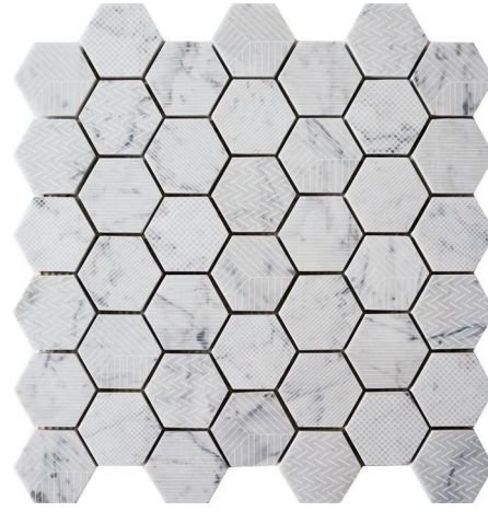
GLADMCAHEX2 | 2x2 hex |